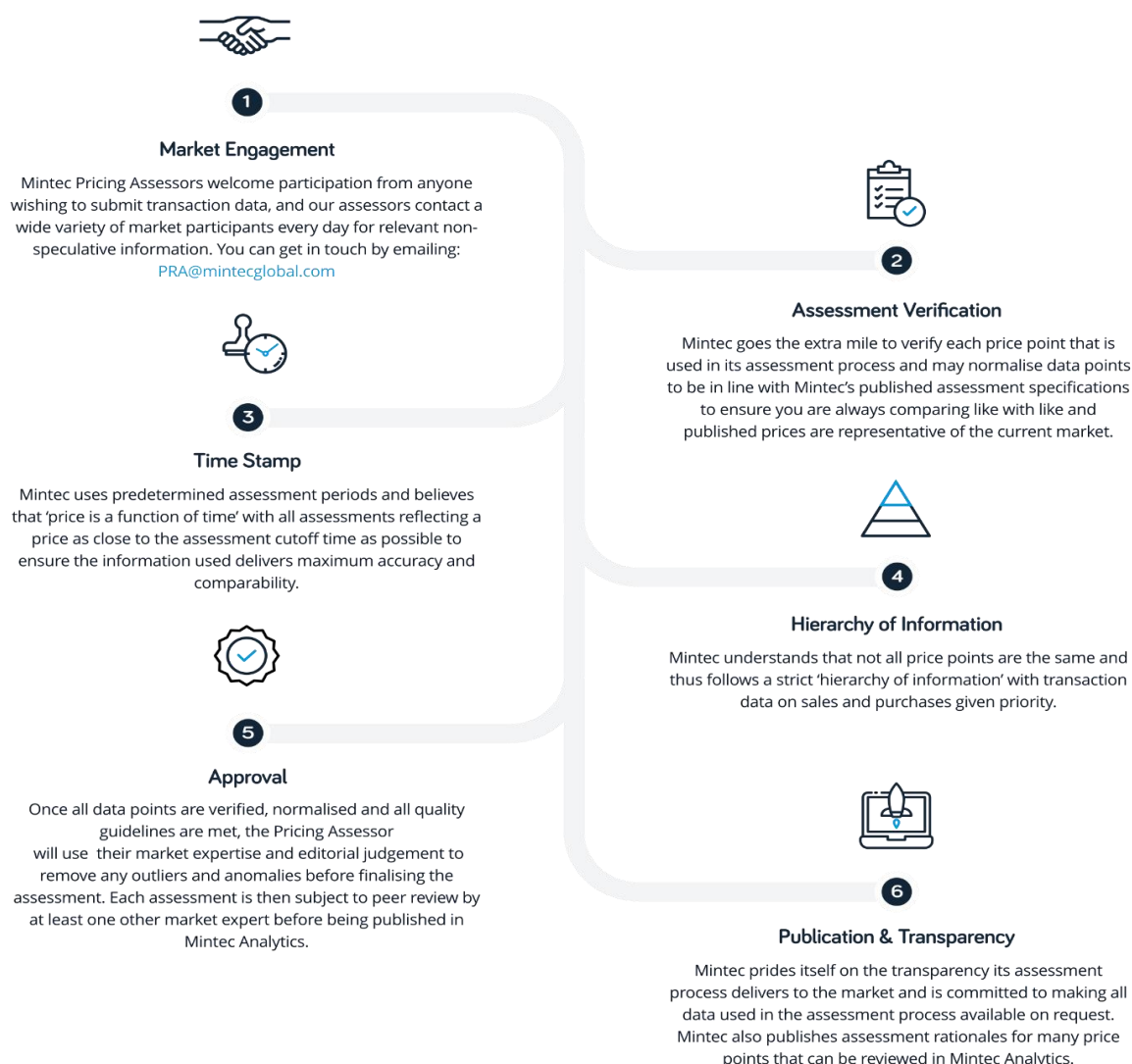
Figure 1: The Mintec Methodology Process Flow Diagram

The market shift towards price assessment and index benchmarking has also brought greater scrutiny to the procedural disciplines in place supporting the Pricing business. Mintec has applied industry-wide principles that have been laid down primarily for the oil and energy markets and is now able to